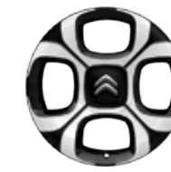
17 INCH 'CROSS' ALLOY WHEELS Standard on Shine