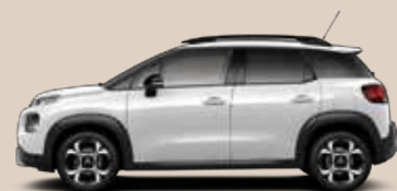
NATURAL WHITE (F)