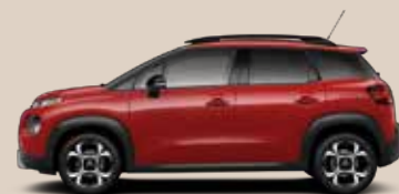
PASSION RED (F)