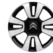
16 INCH 'MATRIX' ALLOY WHEELS Standard on Feel