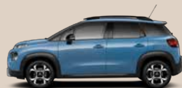
BREATHING BLUE (M)