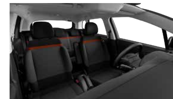
URBAN RED AMBIANCE*

(M) : Metallic - (F) : Flat. *Only for Shine variant.