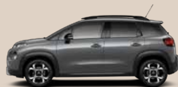
MISTY GREY (M)