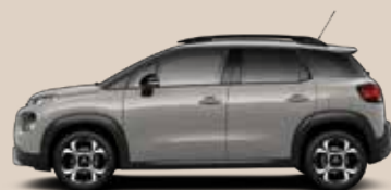
SOFT SAND (M)