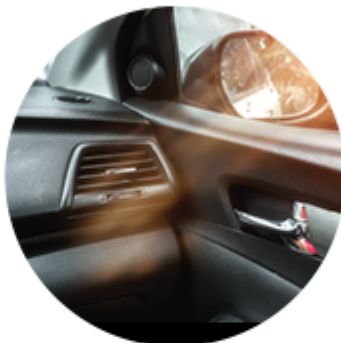
Air con chemical cleaning (usual price $65)