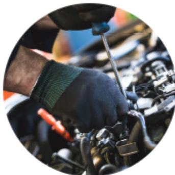
3-in-1 engine additives (usual price $70)