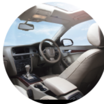
Antibacterial cabin refresh (usual price $38)

Now going at $120 (U.P $173). Purchase this deal at any of our service centres from now till end December 2019!